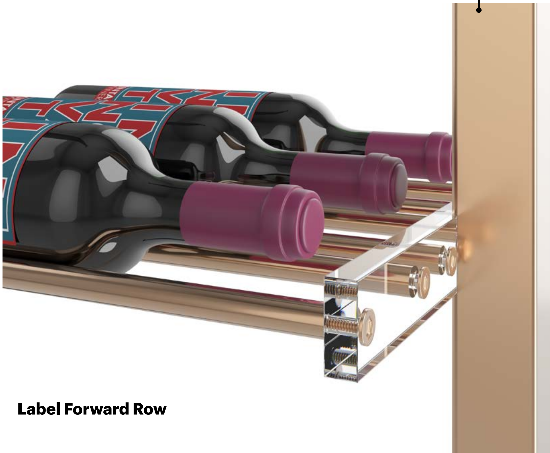
Label Forward Row